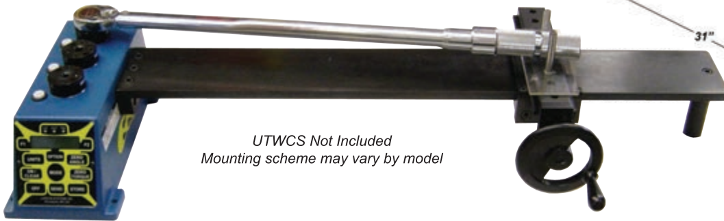
UTWCS Not Included Mounting scheme may vary by model

Easily load your torque wrench and test it the same way every time, regardless of who the operator is. Whether you're using a TWCS with a single torque cell or a UTWCS (pictured) with three torque cells, the Easy Loader Attachment makes test repeatability and reproducibility a breeze! Mounting scheme may vary by model.